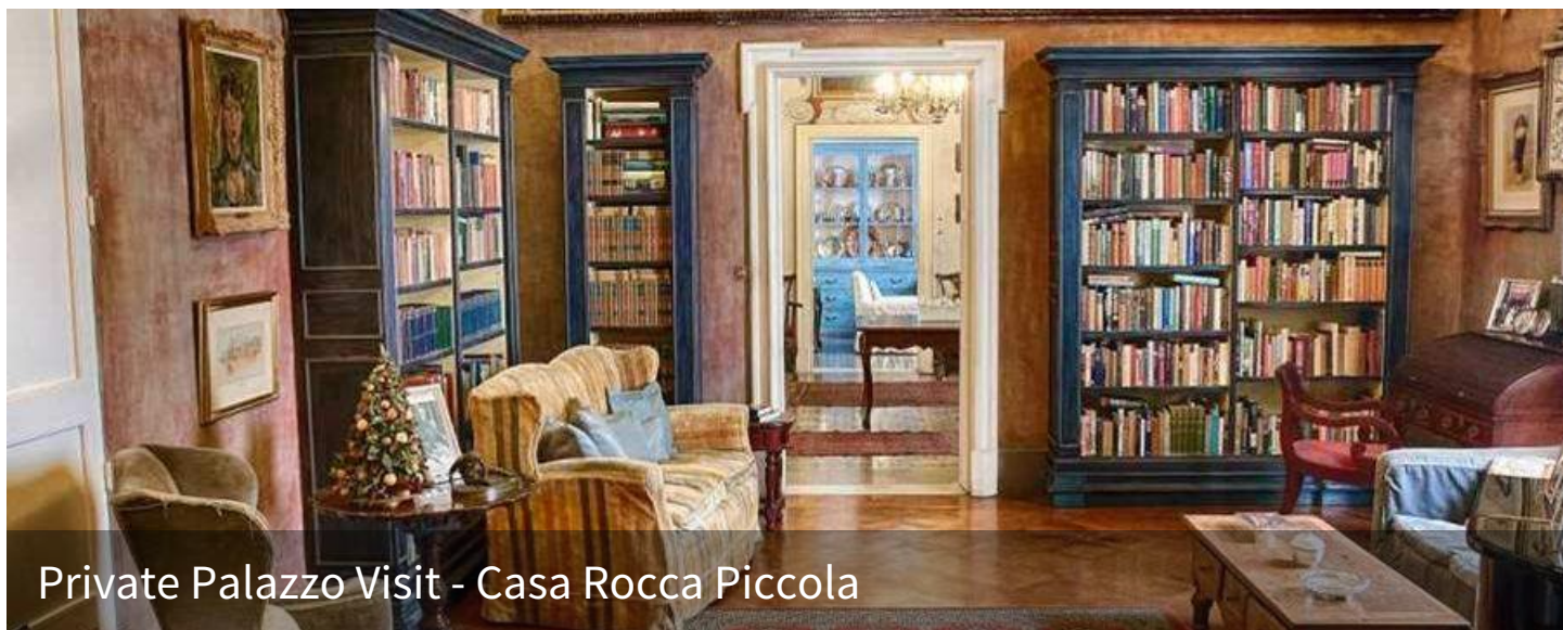
Private Palazzo Visit - Casa Rocca Piccola

Overlooking the Grand harbour and the 3 cities or their mature garden and Marsamxett harbour, the luxurious deluxe rooms offer magnificent views. Most of the Deluxe rooms have a private balcony. Facilities include complimentary WiFi, AC, bath and shower combined, safe, minibar, tea and coffee making facilities and LCD TV. Min size 25 sq.m.