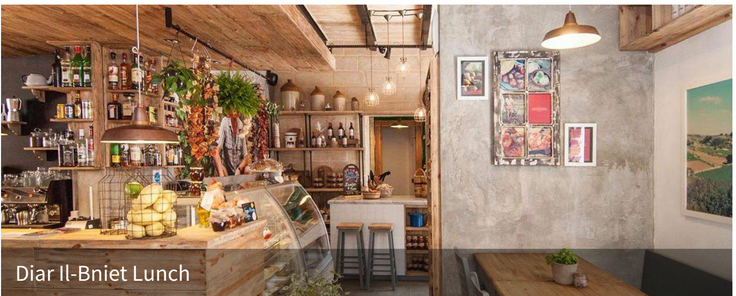
Diar Il-Bniet Lunch

You will be treated to the spectacular views of Dingli Cliffs which are the highest point of the Maltese Islands at 253 metres above sea level. The Cliffs propose a majestic, overlooking the small terraced fields below, the open sea and Filfla & the small uninhabited island (used as target practice during the WWII). Nearby arrive at Clapham Junction to discover the mysterious cart ruts. These deep ruts, rilles, tracks, grooves, channels left in Malta's limestone but in such numbers, variety and confusion that they leave more questions than answers.