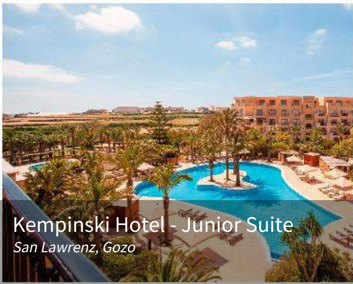
Kempinski Hotel - Junior Suite San Lawrenz, Gozo

With only a 25 minute crossing from North Malta, you'll arrive at the Island of Calypso to discover the neat little gems and differences from it's sister island.