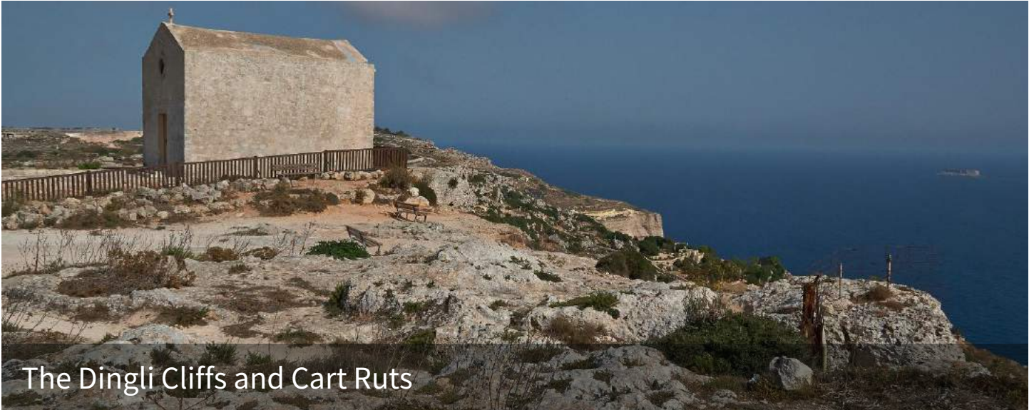
The Dingli Cliffs and Cart Ruts

Return to Malta for your last full day of experiences