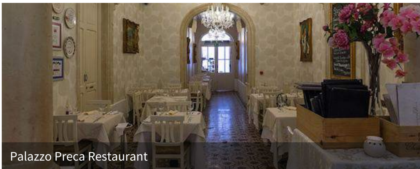
Palazzo Preca Restaurant