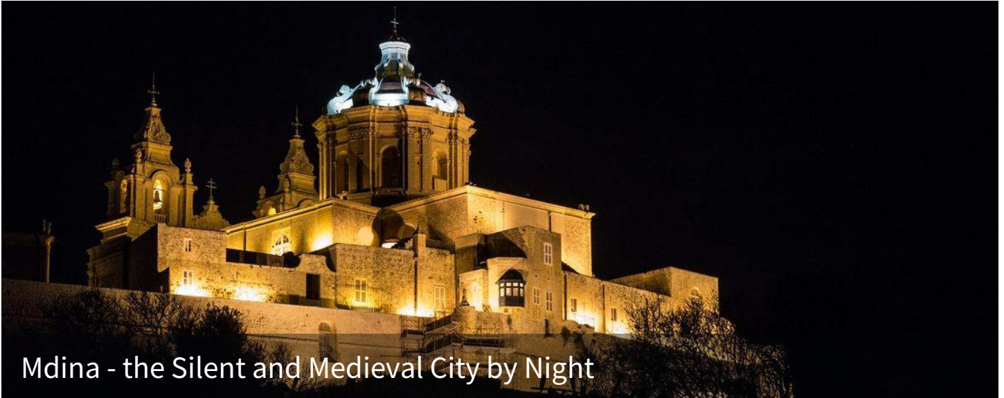
Mdina - the Silent and Medieval City by Night

Enjoy your day at leisure among the Maltese Islands. Explore the Sliema waterfront to make your way back to Valletta. Enjoy.