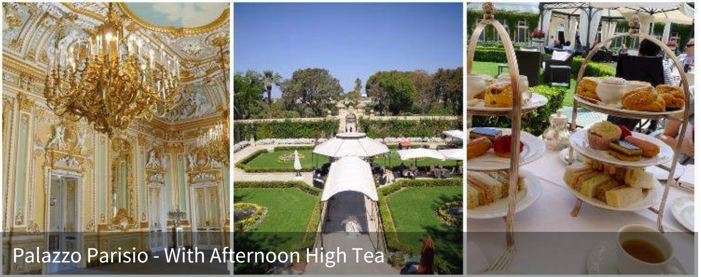
Palazzo Parisio - With Afternoon High Tea

St. Paul's Catacombs are a typical complex of interconnected, underground Roman cemeteries that were in use up to the 4th century AD. They are located on the outskirts of the old Roman capital Melite (today's Mdina), since Roman law prohibited burials within the city. St Paul's Catacombs represent the earliest and largest archaeological evidence of Christianity and Judaism in Malta.