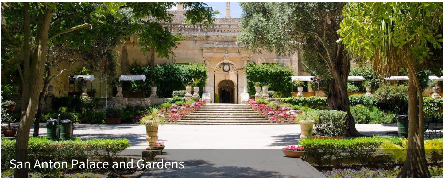
San Anton Palace and Gardens

Today take the morning to relax utilizing some of the hotel amenities.