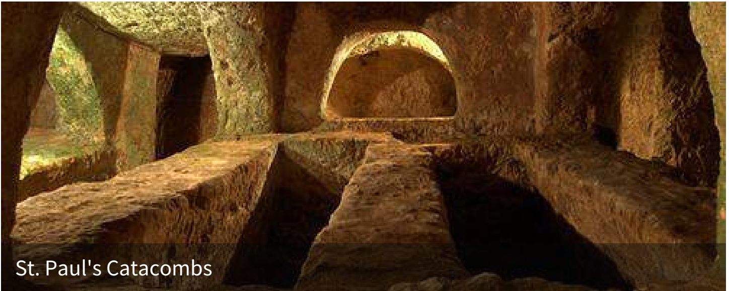
St. Paul's Catacombs

St. Paul's Catacombs are a typical complex of interconnected, underground Roman cemeteries that were in use up to the 4th century AD. They are located on the outskirts of the old Roman capital Melite (today's Mdina), since Roman law prohibited burials within the city. St Paul's Catacombs represent the earliest and largest archaeological evidence of Christianity and Judaism in Malta.