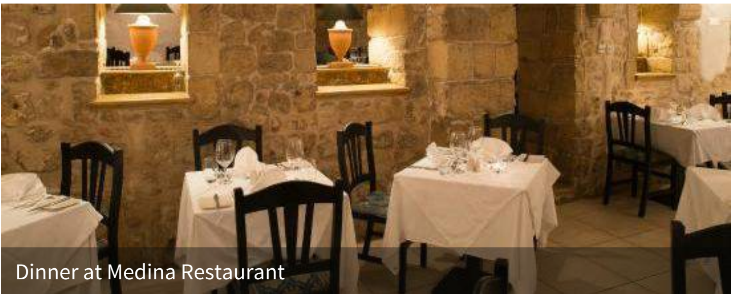
Dinner at Medina Restaurant

You will feel the power as you enter the Old Capital City of Mdina and fall in love with it inasmuch as the families who continue to live here. It's Malta's only medieval city with a range of architecture that includes Norman and Arabic features. If you're a Game of Thrones fan, you will recognize the main gates immediately.