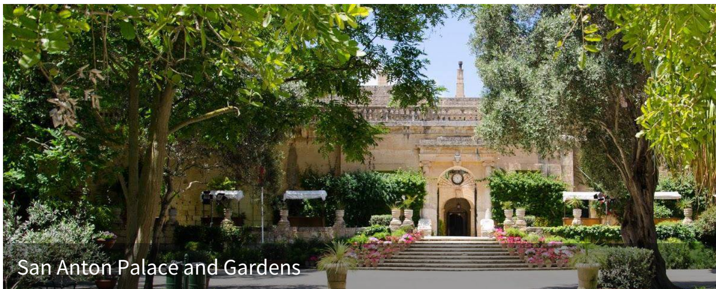
San Anton Palace and Gardens

St. Paul's in London. However the most interesting part of its existence is something that happened on April 9th, 1942 when a German bomb was dropped on it and pierced the dome with parishioners in attendance. It did not explode. According to the locals, it was a miracle!