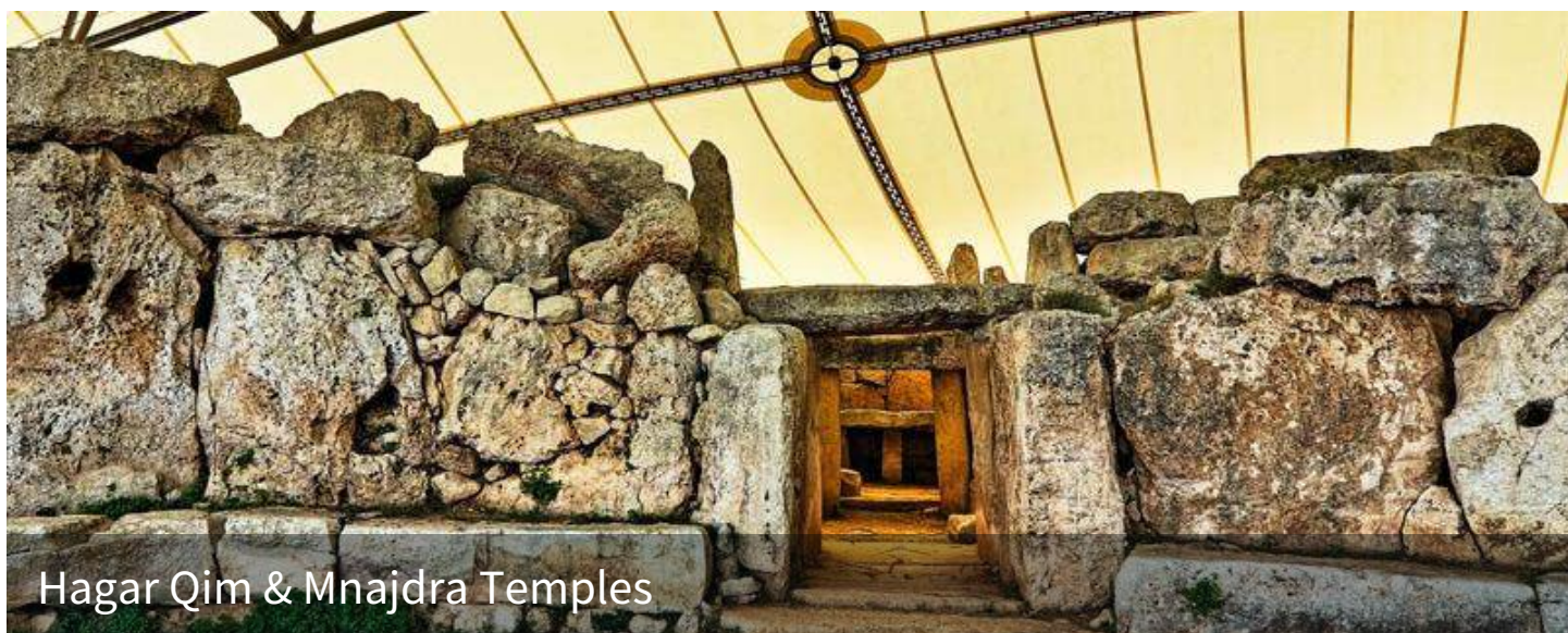
Hagar Qim & Mnajdra Temples

Step back some 5500 years with a visit to the Hagar Qim and Mnajdra Temple sites. The temples were excavated in 1839 and are thought to have been built to worship a type of fertility goddess.