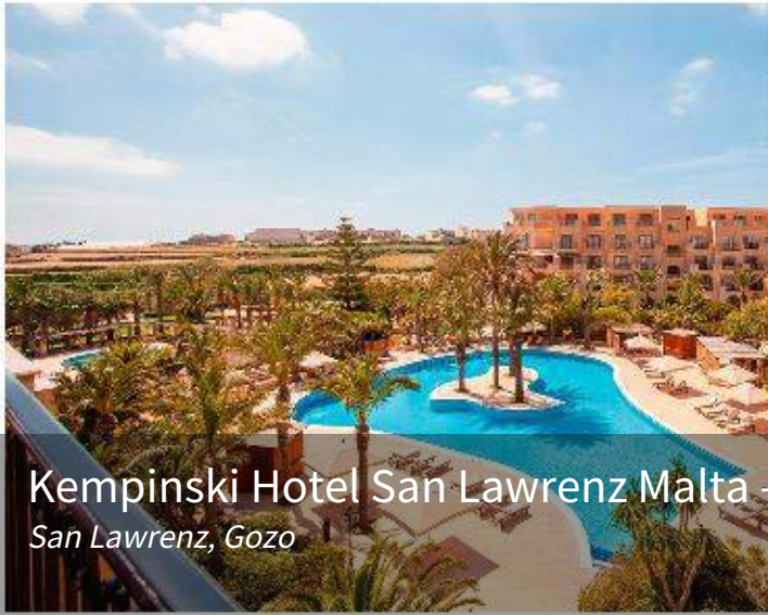
Kempinski Hotel San Lawrenz Malta - San Lawrenz, Gozo