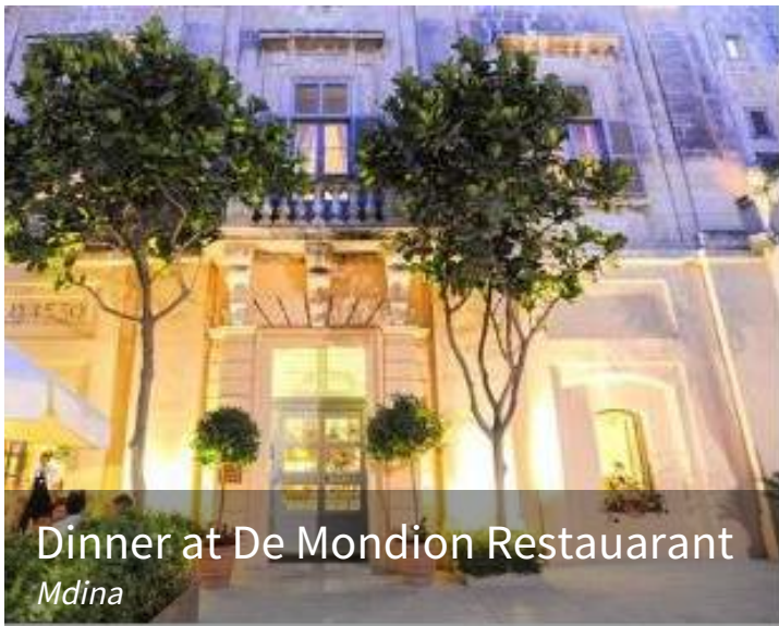
Dinner at De Mondion Restaurarant Mdina