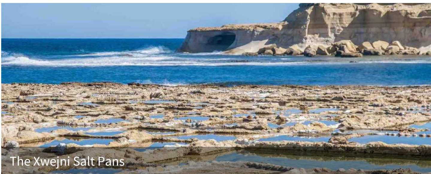
The Xwejni Salt Pans