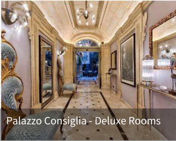
Palazzo Consiglia - Deluxe Rooms