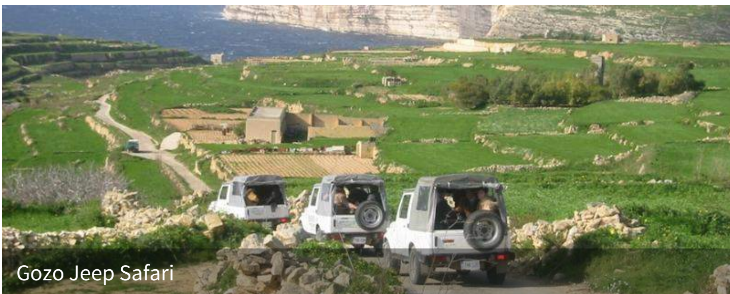
Gozo Jeep Safari