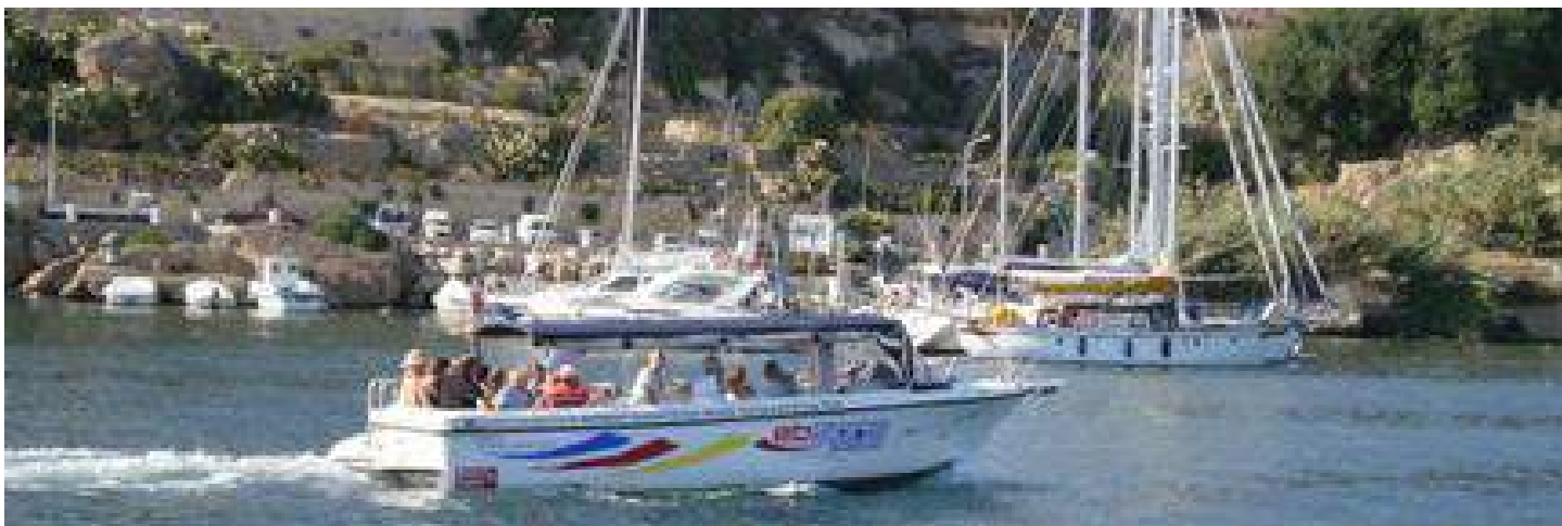
Transfer to Gozo (Private)