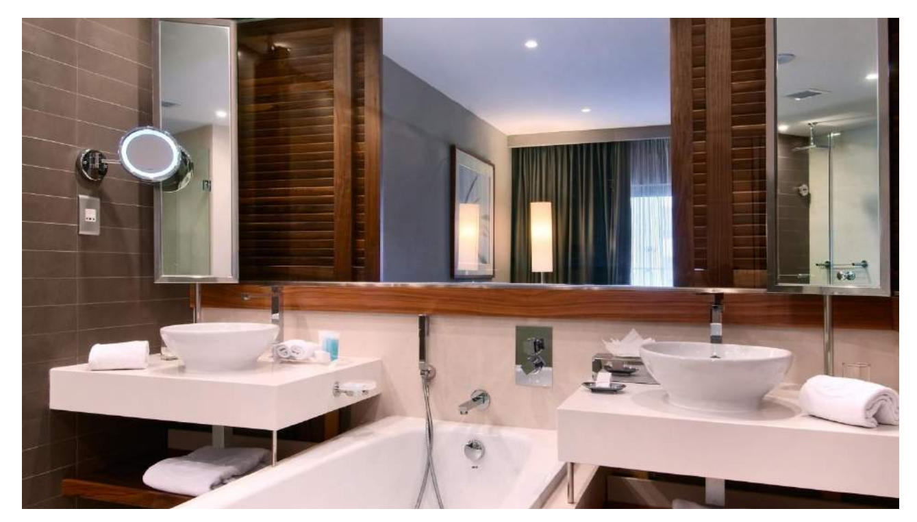
Executive Sea-View (also has a shower)